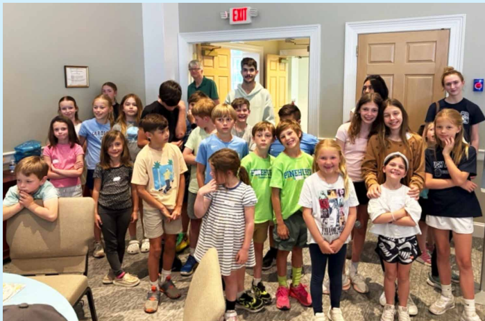
The PAWS kids waiting to sing at the Spring Fling

On April 29th we will graduate 12 of our 5th graders and send them on to Youth Group! Please keep them in your prayers as they look forward to middle school and new experiences.