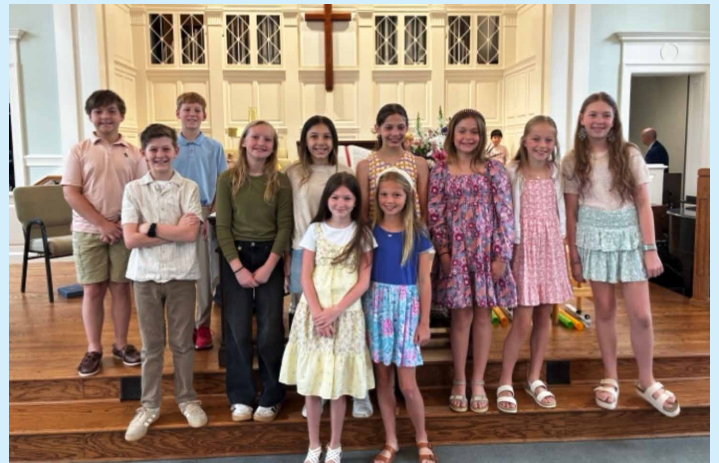
11 of our 5th grade PAWS kids.