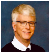
John Liles Care