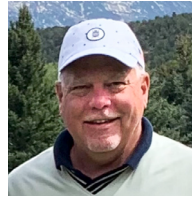
Bruce Geddes Property & Grounds