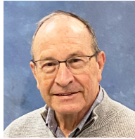
Joe Franklin Membership