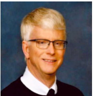
John Liles Care